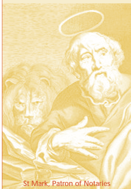
St Mark, Patron of Notaries

March 31st Easter Sunday April 5th St Vincent Ferrer April 25th St Mark the Evangelist