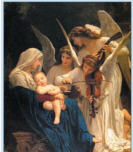
La Vierge aux Anges (The Virgin with Angels) 1881

Cathedral and parish Mass times for the Christmas period have been posted on the Archdiocese website, www.sydney.catholic.org.au