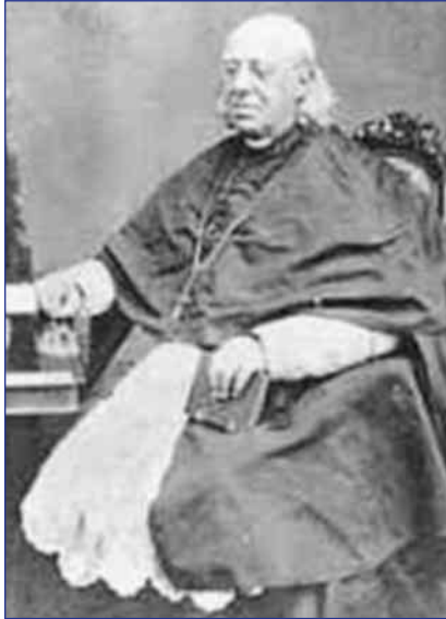
Offices named after Archbishop Polding

For further information and updates on the move, please see the separate publication 133 Liverpool St.