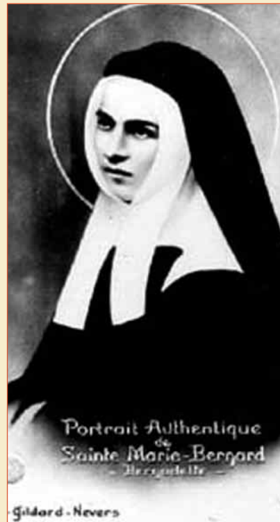
St Bernadette of Lourdes