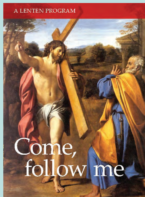
Copies may be purchased by contacting CAEC on 9643 3660.

It comes as a booklet accompanied with a CD. Each session begins with a prayer and Taizé hymn, followed by a reading from the Gospel passage appropriate to the Lenten theme, a commentary on the Gospel, questions for reflection and discussion, a brief recorded meditation, responsorial psalm and prayers of intercession.